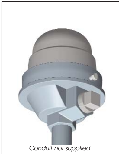
Pendant Mount Configuration RTO-BW07-001 (w/ Junction Box)