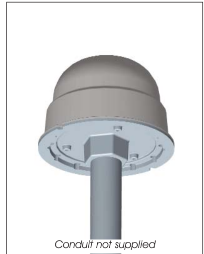
Pendant Mount Configuration RTO-BW07-004