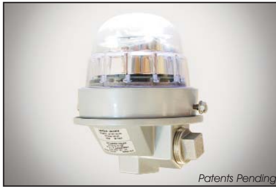
Shown with Junction Box (RTO-BW07-001)